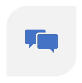
STAKEHOLDER MEETINGS WITH WRITTEN COMMENTS