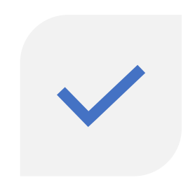
MATERIALS POSTED ON THE BUREAU OF INSURANCE WEBSITE