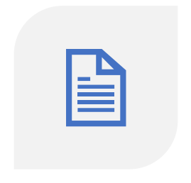
FILINGS TO BE REVIEWED AND APPROVED BY BUREAU OF INSURANCE JUNE-AUGUST